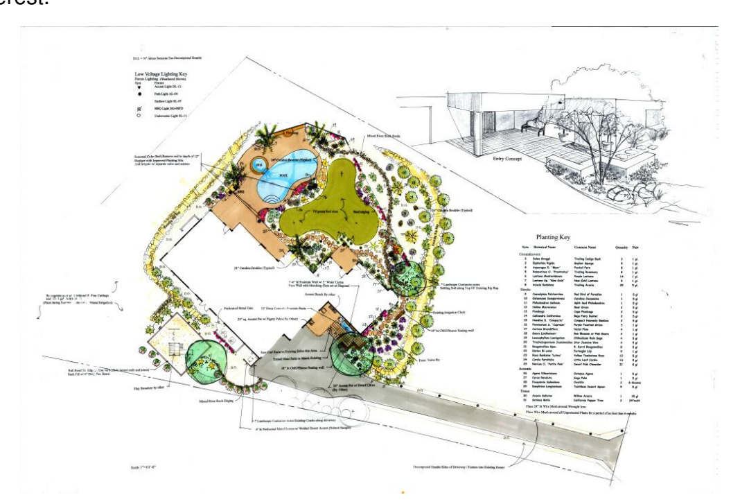
Properly specified landscape plan with legend enables fair bidding, (picture from Man of Soil Landscape Builders.

When a design-build contractor delivers a general, poorly depicted, unspecified landscape design, the client should be aware of potential conflict of interest. A conflict of interest occurs when the contractor acts as both the "judge and jury". An example would be a landscape contractor who provides a landscape design based on their knowledge of the cheapest plants available at the local nursery. They use these plants not because of their design value, only because of the cost savings to the contractor. When a design-build contractor sacrifices project design principles for construction cost savings, they have failed to satisfy their professional standard of care and have displayed a professional conflict of interest.